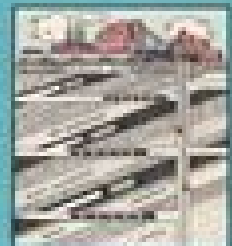
BRIDGING THE COAL