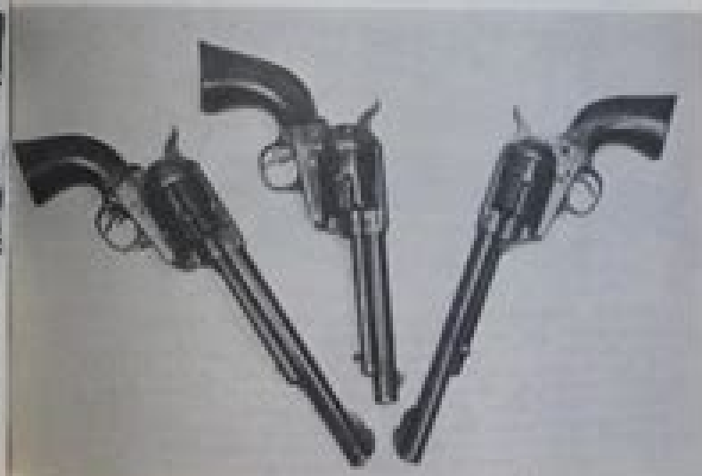
Plate 21. A. Smith's 177 caliber rifle. Action open. (Author's Collection.) B. Remington 11/43 mm. caliber Express Model (R.M.) C. Smith - 177 caliber rifle. Action open. (Author's Collection.)