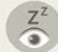
Lack of sleep