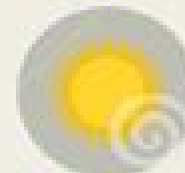
Prolonged exposure to the sun