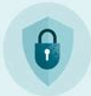
Security and privacy policies