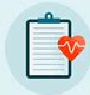
Employee health policies