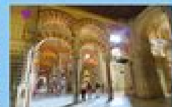
The Museum highlights of Architecture in Seville, Cordoba and Granada