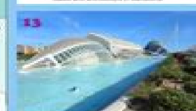
Valencia with Turia Park and modern architecture