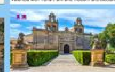
The temple of the city of Toledo, and the Santa Catalina National Park