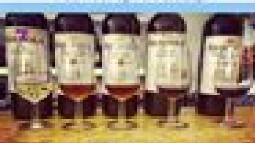
Visit the vineyards of Jerez de la Frontera