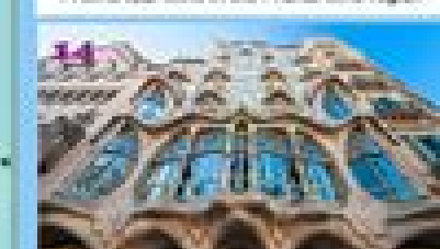
Gaudi and architecture in Barcelona