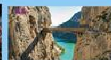
Hiking Camino del Rey and El Torcal