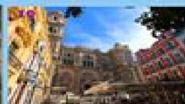
Take a route tour of Malaga