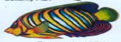
Empress Angel Fish