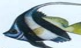
Schooling Banner Fish