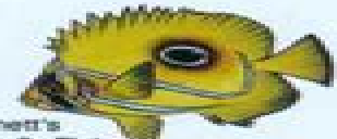
Bennett's Butterfly Fish