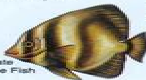
Pinnate Spade Fish