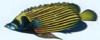
Imperial Angel Fish