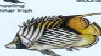
Tread Fin Butterfly Fish