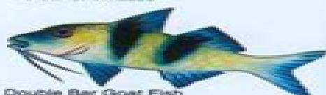
Double Bar Goat Fish