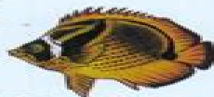
Raccoon Butterfly Fish