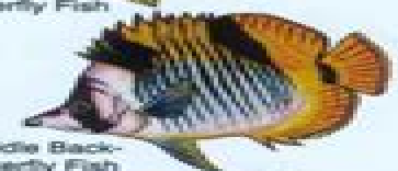
Saddle Back-Butterfly Fish