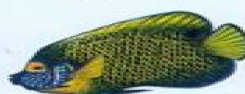
Blue Faced Angel Fish