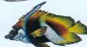
Masked Banner Fish