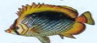
Black Backed Butterfly Fish