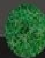
PLANT PALETTE : EDGE RAIN GARDEN (DRAWN BY AUTHORS)