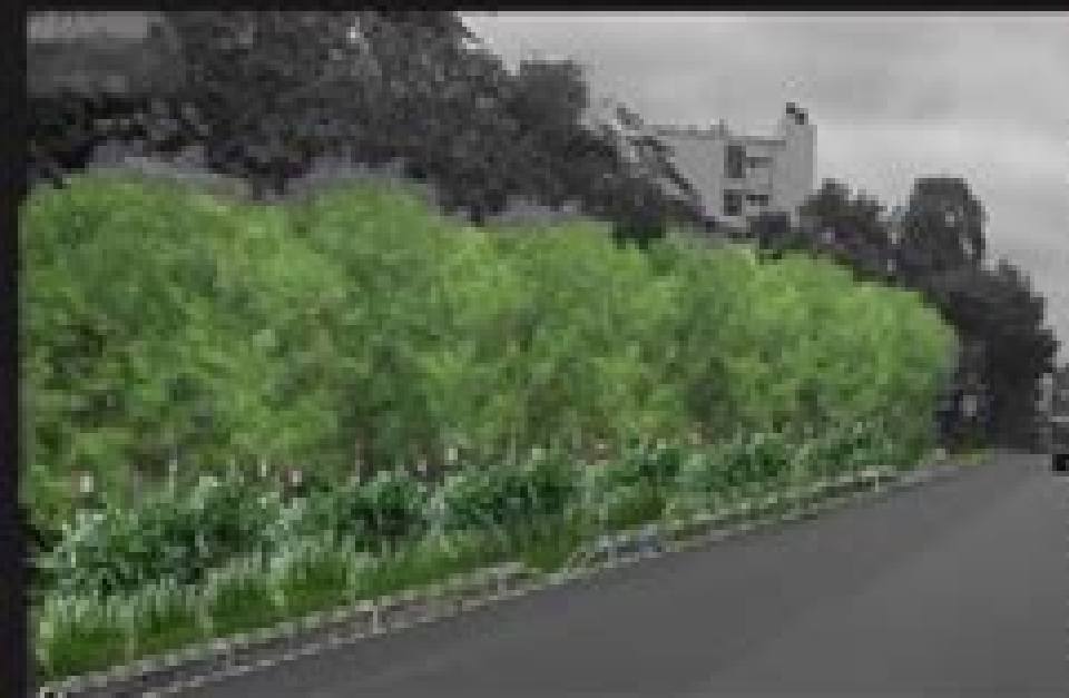
PROPOSED EDGE RAIN GARDEN (DRAWN BY AUTHORS)