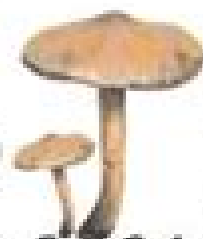
White Pine Bolete