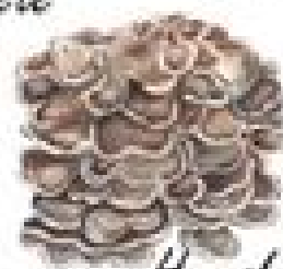
Hen of the Woods