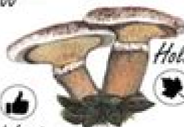
Hollow Stem Larch Saillas