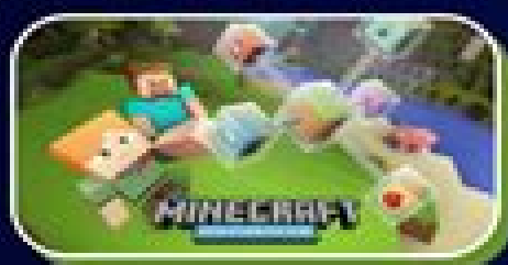
MINECRAFT - EDUCATION EDITION