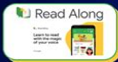
GOOGLE READ ALONG