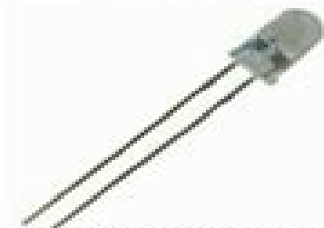
Light Emitting Diode