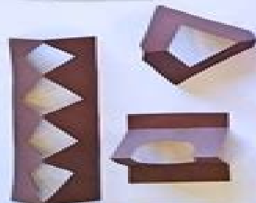
fold & cut