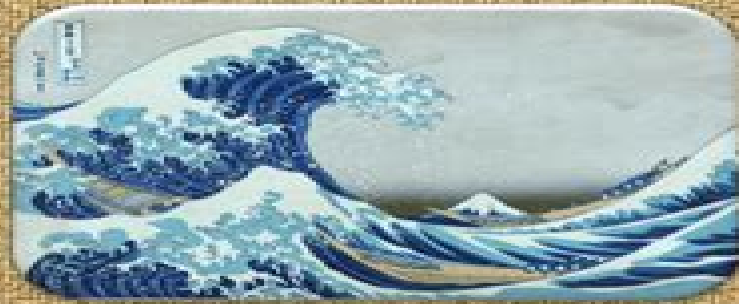
Great Wave by Kanagawa