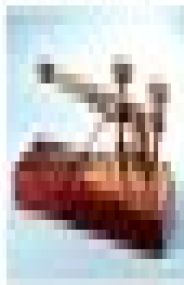
Samuel Morse invents the Telegraph