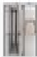
Elisha Otis invents the Elevator Safety Break